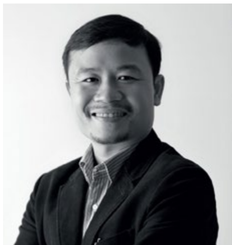
Vo Trong Nghia (Vietnam)