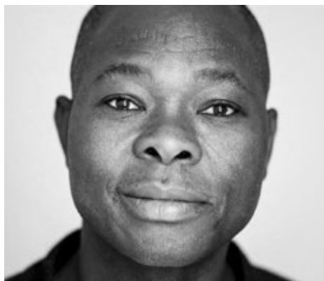
Diebedo Francis Kere (Burkina Faso)