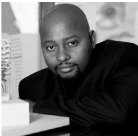
Mokena Makeka (South Africa)