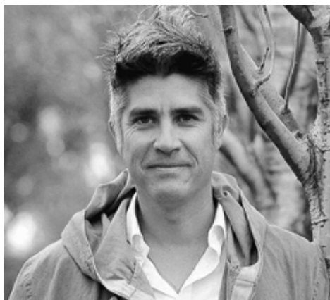
Alejandro Aravena (Chile)

We will be very glad to see outstanding architects from these regions on our site. For example: